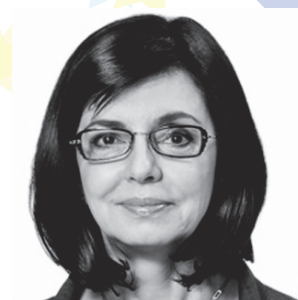
Meglena Kuneva Deputy Prime Minister for European Policies Coordination and Institutional Affairs, ECFR Council Member (Bulgaria)