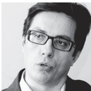
Stevo Pendarovski Assistant Professor, the University American College Skopje (Macedonia)

Stevo Pendarovski is Assistant Professor in International Security, Foreign Policy and Globalization at the University American College Skopje. In 2014 he was candidate in the Macedonian presidential elections of the Social Democratic Union of Macedonia. He was National Security and Chief Foreign Policy Adviser to President Boris Trajkovski from 2001 until 2004. After heading the State Election Commission in 2004–2005 he went on to serve again as National Security and Chief Foreign Policy Adviser to the following President, Branko Crvenkovski, from 2005 to 2009.