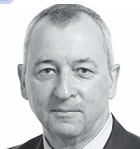
Georgi Pirinski Member of the European Parlia- ment, ECFR Council Member (Bulgaria)

Georgi Pirinski is Member of the European Parliament since 2014. He is member of the Committee on Employment and Social Affairs and the Committee on Budgetary Control. Previously, he was Member of the Bulgarian National Assembly for the period 1990-2013 and a President of the 40th Bulgarian National Assembly. During the same period he was member of the Leaderships of the Bulgarian Socialist Party and of the Parliamentary Group of the Coalition for Bulgaria. From 2005 to 2009 he was Chairman of the Programme Commission of the Bulgarian Socialist Party. Georgi Pirinski was Minister of Foreign Affairs of Bulgaria in the period 1995-1996. He was also member of the VII Grand National Assembly in 1990-1991.