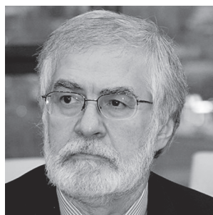
Ghia Nodia Chairman of the Caucasus Institute for Peace, Democracy and Development (Georgia)

Georgi Pirinski is Member of the European Parliament since 2014. He is member of the Committee on Employment and Social Affairs and the Committee on Budgetary Control. Previously, he was Member of the Bulgarian National Assembly for the period 1990-2013 and a President of the 40th Bulgarian National Assembly. During the same period he was member of the Leaderships of the Bulgarian Socialist Party and of the Parliamentary Group of the Coalition for Bulgaria. From 2005 to 2009 he was Chairman of the Programme Commission of the Bulgarian Socialist Party. Georgi Pirinski was Minister of Foreign Affairs of Bulgaria in the period 1995-1996. He was also member of the VII Grand National Assembly in 1990-1991.