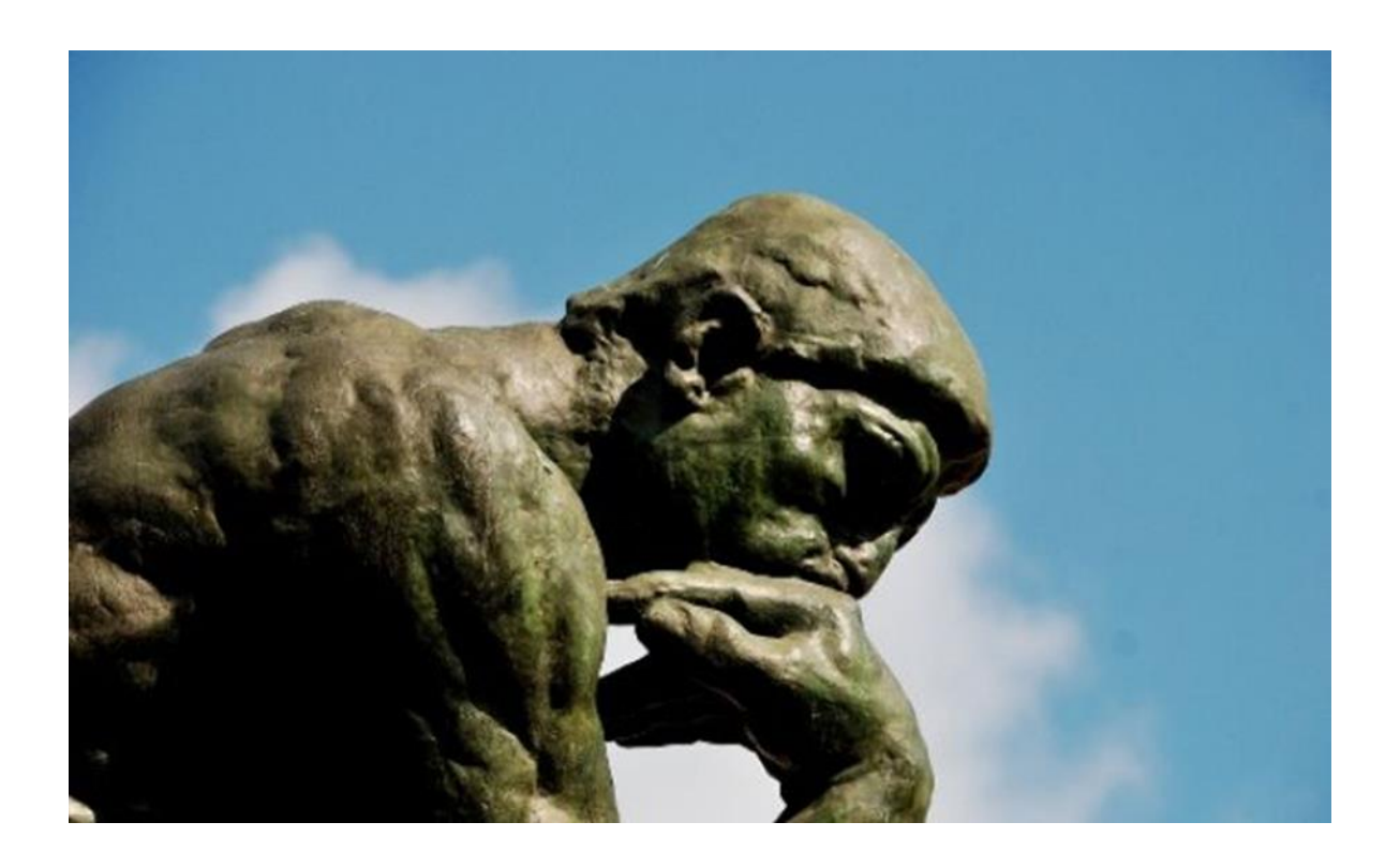
Top Think Tank in the World for 2014

With that, it gives me great satisfaction and pleasure to present the results of the 2014 rankings process below.