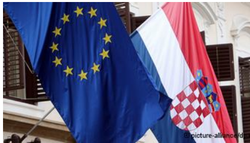
Croatia has been working to join the EU for years

"Bosnia and Herzegovina is constitutionally a complex country; that is well known, because it has a structure of entities and the state level," he told DW. "But aside from that there is no reason why faster progress has not been made."