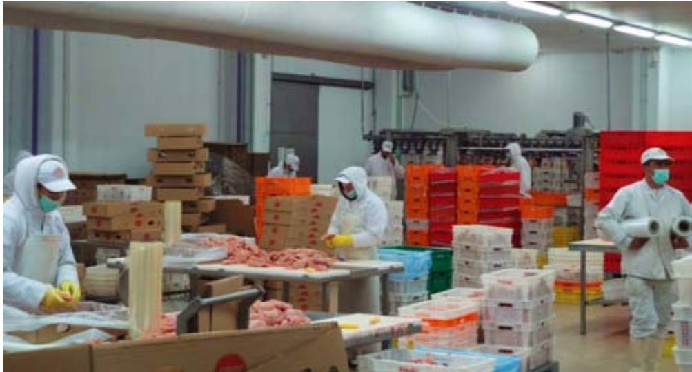
Brovis packing station

Although the hygiene package has been adopted as recently as 29 October 2012, implementation is still a big factor. Adoption of laws does not inherently result in implementation.