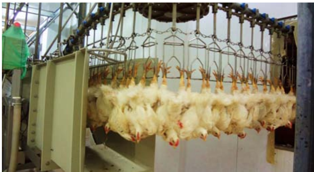
Broilers entering the Brovis slaughterhouse from the depot

either to the State or producers which are dealing with the possibility of great financial losses as a consequence of terminated export. Will this particular local story remain successful after 1 January?