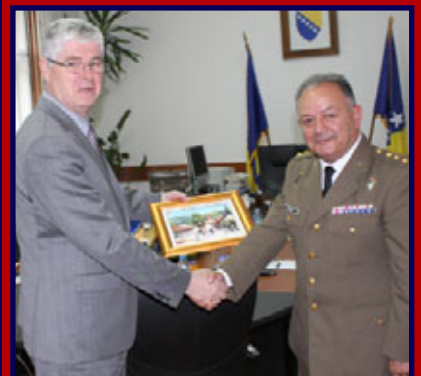
Defense Minister Zekerijah Osmic receives a Spanish delegation in the Defense Ministry