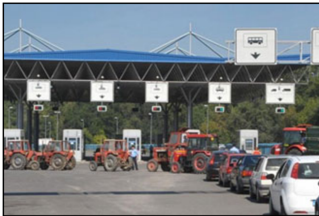
Farmers in Bosnia protested government agriculture policies

She said the main reason politicians have failed to solve this issue is because the government has been fractured ever since the brutal war of the 1990s. The