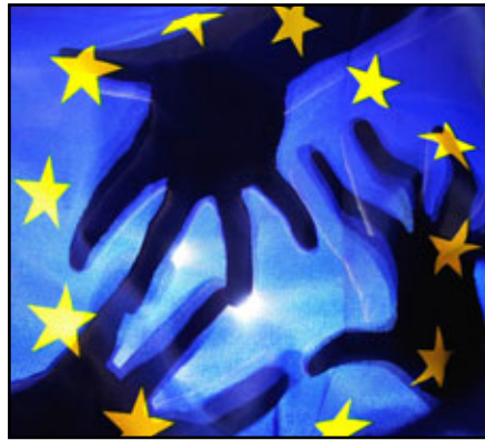
Exhaustive experience is expecting all remaining Balkan countries seeking to join the EU

expert from the University of Graz. Strong interest in approaching toward the EU brought the prime ministers of Serbia and Kosovo to a compromising formula that caused anger among extreme nationalists in both countries who called them "national traitors". For getting green light for EU accession negotiations Serbia was ready to leave in the lurch Kosovo's Serbs. For getting a promise it will be also once an EU can-