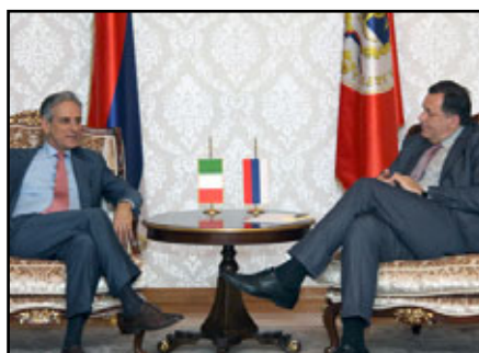
Raimondo De Cardona and Milorad Dodik

Republika Srpska President Milorad Dodik and Italian Ambassador to Bosnia and Herzegovina Raimondo De Cardona agreed in Banja Luka that Bosnia and Herzegovina lacks political progress, especially when it comes to the implementation of the European Court of Human Rights' ruling in the case of Sejdic-Finci vs. BiH and the state property issues. Dodik stated that the RS was interested to see BiH function in line with the provisions of the