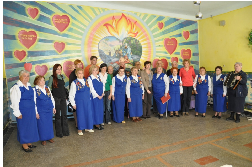
Day care for elderly people “Seigniors’ Club” Brody, Lviv oblast