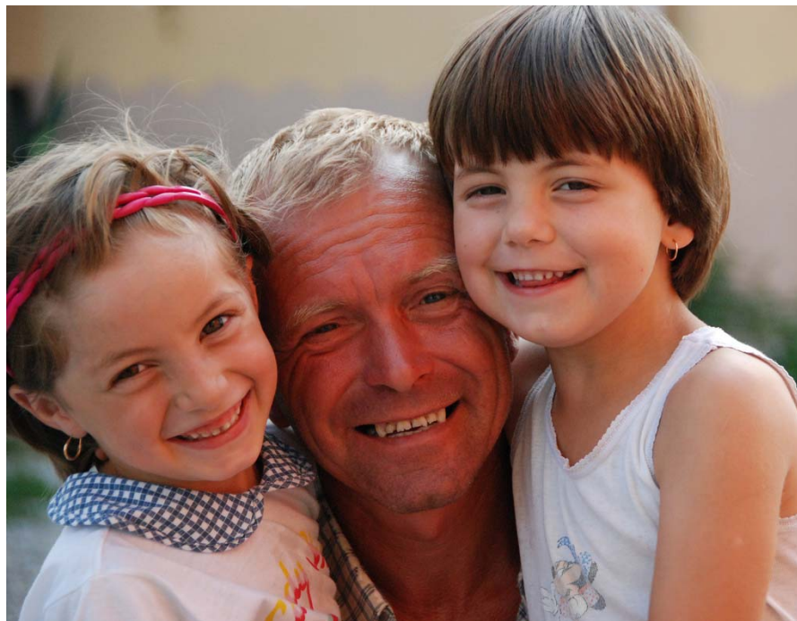
Foster home Rativtsi village, Zakarpattya